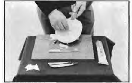
3. Using a piece of card (cut from the rubber packaging) spread glue evenly, paying particular attention to the edges. Place the blade aside.