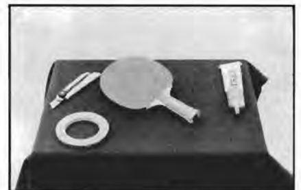
12. Finally remove the protective papers which have prevented damage to the rubber during assembly and you are ready to play.

Clive Oakman Table Tennis Services will be represented at most major events during the season, including all of the Stiga 3 Star Grand Prix Tournaments. Clive or his assistant will be pleased to advise you on all aspects of racket construction and equipment selection.