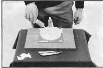
2. Apply glue in a line across the base of the wooden blade.