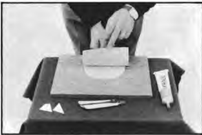
7. While holding the handle, gently lower the rubber into place.