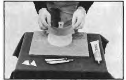
6. Retrieve blade and position rubber centrally at the handle.