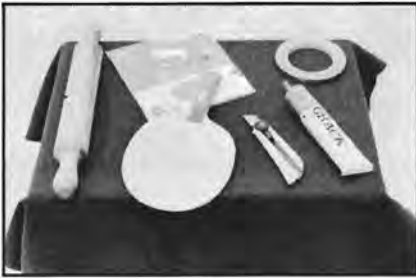
1. Prepare a clean, flat work area, with a firm base, and assemble your kit.

Cover your new racket successfully by following these twelve easy stages described by Clive Oakman.