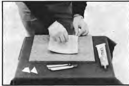
5. Spread glue evenly.