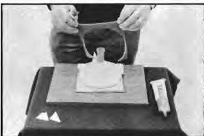
10. Remove all the excess rubber and repeat the operation on the other side of the blade.