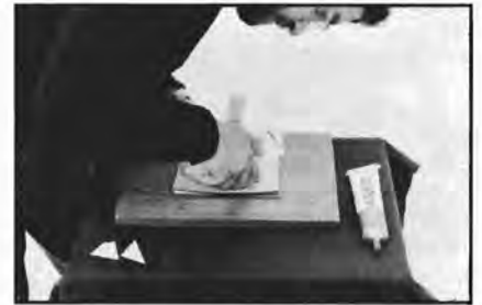
9. Turn the blade over. Press down firmly on the blade as you cut around the perimeter with a sharp knife (a snap off model making blade is ideal).