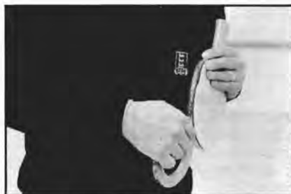
11. Edging tape is inexpensive and will protect your blade from damage.