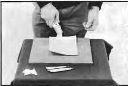
4. Ensure that the work surface is glue free. Then place rubber, playing face down, on the board and apply glue. If the rubber is covered by a protective paper it is wise to leave this in place.