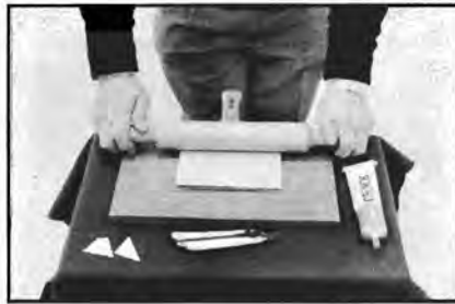
8. Using an ordinary clean kitchen rolling pin roll firmly 2 - 3 times.